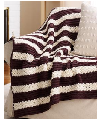
Herringbone Striped Afghan, pg. 20