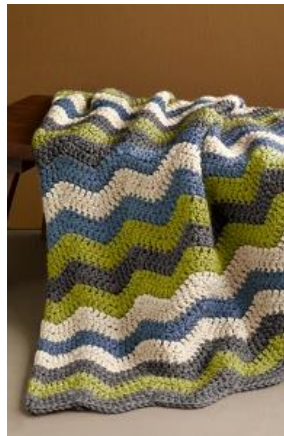
Manly Ripple Afghan, pg. 11